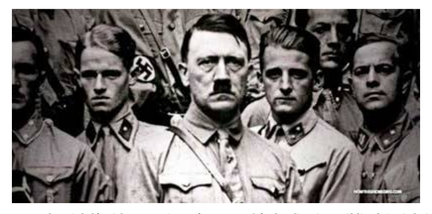
7 Ways That Adolf Hitler Was A Perfect Type Of The Coming Biblical Antichrist

Pacelli came to learn of the Nazi plans to exterminate the Jews of Europe shortly after they were laid in January 1942. The deportations to the death camps had begun in December 1941 and would continue through 1944. All during 1942, Pacelli received reliable information on the details of the Final Solution, much of it supplied by the British, French, and American representatives resident in the Vatican. On March 17, 1942, representatives of Jewish organizations assembled in Switzerland sent a memorandum to Pacelli via the papal nuncio in Bern, cataloguing violent anti-Semitic measures in Germany and in its allied and conquered territories. Their plea focused attention on Slovakia, Croatia, Hungary, and unoccupied France, where, they believed, the Pope's intervention might yet be effective. Apart from an intervention in the case of Slovakia, where the president was Monsignor Josef Tiso, a Catholic priest, no papal initiatives resulted. During the same month, a stream of dispatches describing the fate of some 90,000 Jews reached the Vatican from various sources in Eastern Europe. The Jewish organizations' long memorandum would be excluded from the wartime documents published by the Vatican between 1965 and 1981.